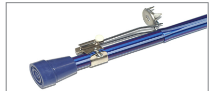
Ice grip up for indoor use