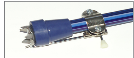
Ice grip down for outdoor use

Screw the two parts of the ice grip together